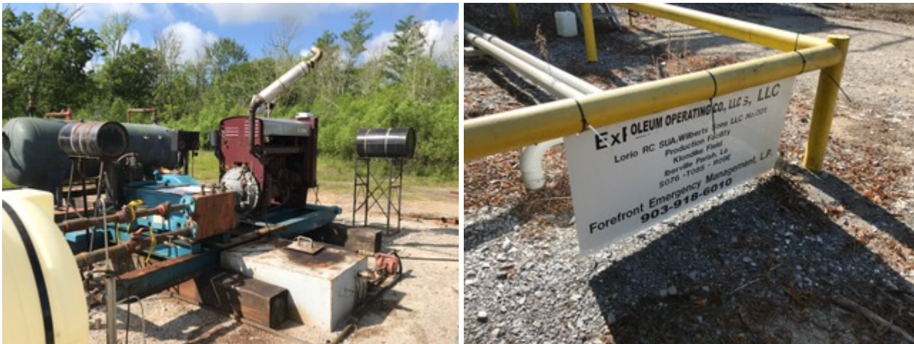
Production Facilities at West Klondike